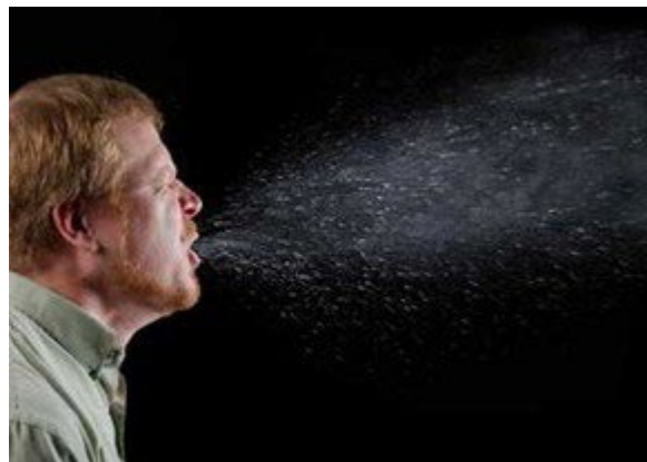
Airborne droplets visible during sneezing (photo enhanced).

Healthcare personnel who care for patients with ATDs must work in close proximity to the source of the hazard; even with controls in place, they are likely to have a higher risk of inhaling infectious aerosols (droplets and particles) than the general public. These personnel, and others with a higher risk of exposure related to the tasks they perform (e.g., lab or autopsy workers), must often be protected further through the proper use of