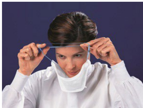
Worker donning a filtering facepiece respirator.

can cause an increased resistance to breathing or a build-up of carbon dioxide inside the facepiece. This can lead to medical complications in individuals for whom it may not be safe to wear a respirator. It may also be unsafe for someone with moderate to severe claustrophobia to wear a respirator. Medical evaluations must be provided by the employer during work time and at no cost to the employee.